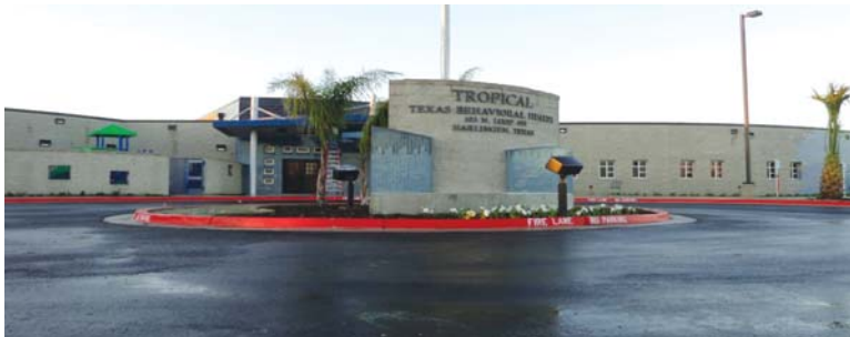
Harlingen Building, completed December 2013